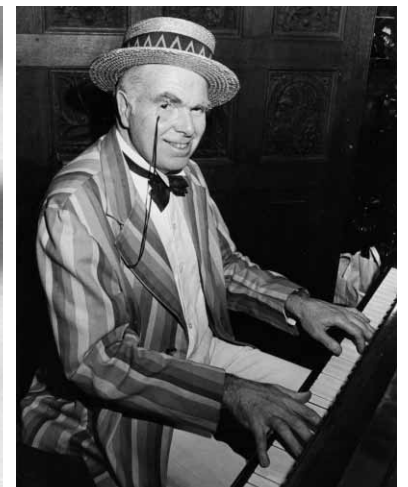
Inside Front Cover